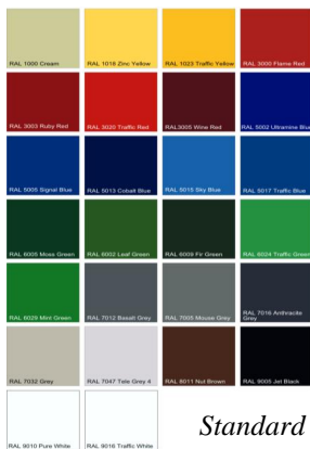
Standard Colour Chart